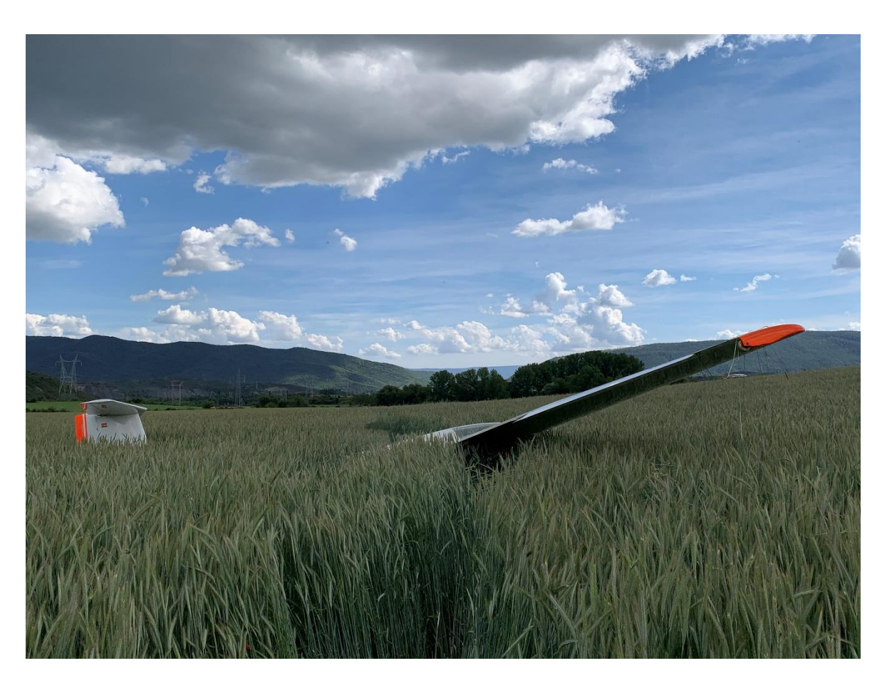
Fig. no. 1 - Aircraft in its final position

The aircraft landed in a field planted with a cereal crop; on hitting the crop, it made a sharp right turn and came to a sudden stop.