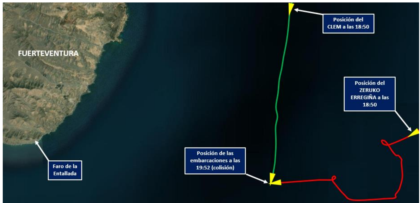
Figura 5. Courses followed by the fishing vessel ZERUKO ERREGIÑA (in red) and the recreational vessel CLEM (in green) since one hour before the accident.

The skipper did not succeed in stopping the advance of the ZERUKO ERREGIÑA, which collided with the sailing vessel CLEM at 7 nautical miles to the east of the lighthouse of La Entallada, Fuerteventura, at position 28° 13.59'N 013° 49.3'W.