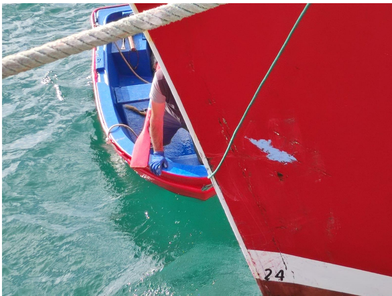
Figura 6. Close-up of the damage suffered by the ZERUKO ERREGIÑA during the accident

On 31 March a technician from a boatyard in Arrecife inspected the damage to the fishing vessel ZERUKO ERREGIÑA (see Figura 6). In his report, the technician stated that during his inspection he did not observe any structural damage in the zone affected by the collision, but only a few scratches.