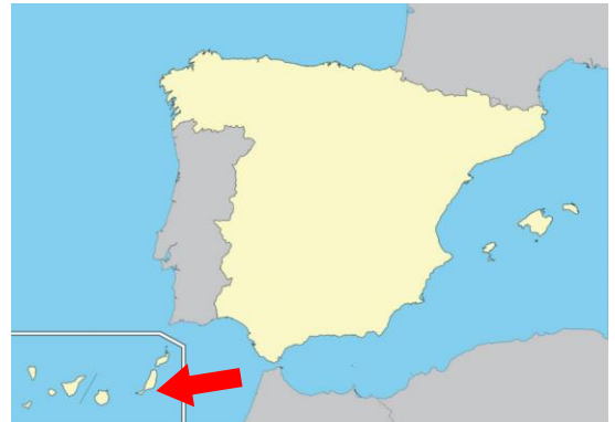
Figura 3. Accident site