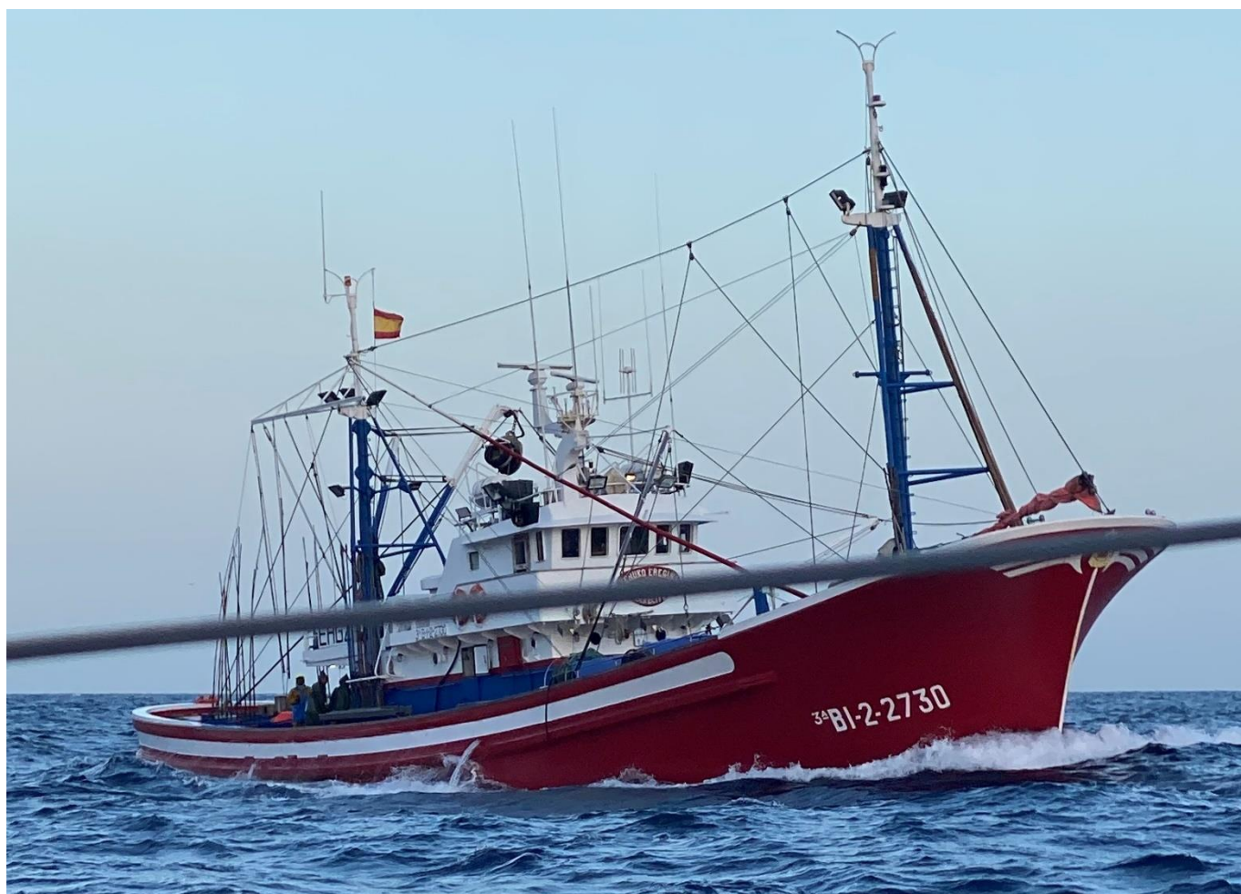
Figura 8. Photograph of the fishing vessel ZERUKO ERREGIÑA taken by the skipper of the CLEM just before the accident