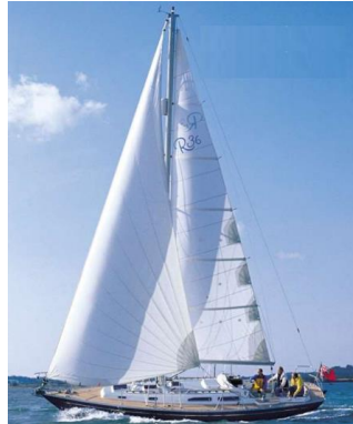
Figura 2. Rustler 36, model of the recreational sailing vessel CLEM