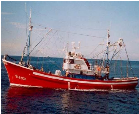
Figura 1. Fishing vessel ZERUKO ERREGIÑA