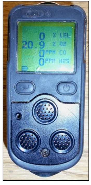
Figure 4: GMI type PS241 gas detector

The gas detector alarms for H_2S were set at 5 ppm for high alert and 10 ppm for highhigh alert.