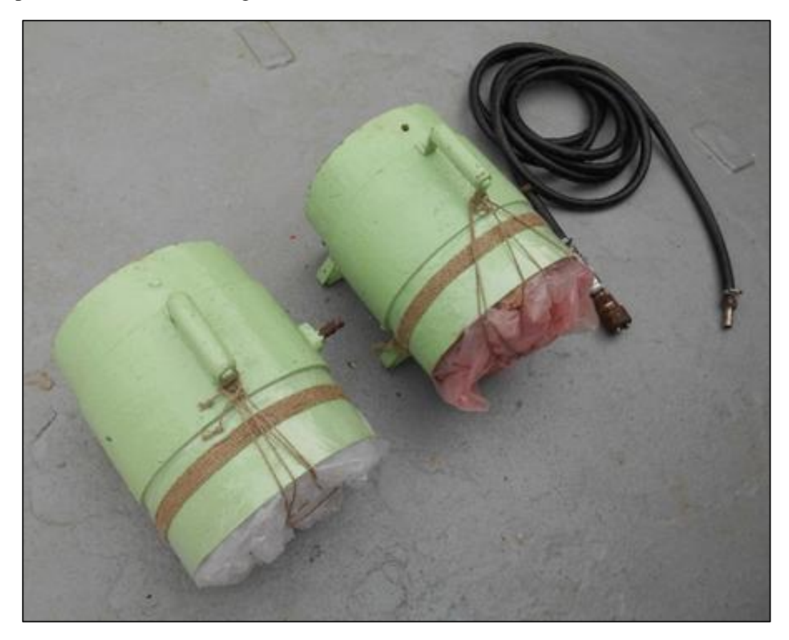
Figure 3: Portable ventilation fans

air and consisted of a metal fan enclosure with a plastic extension hose which was placed into the tank through the tank-hatch.