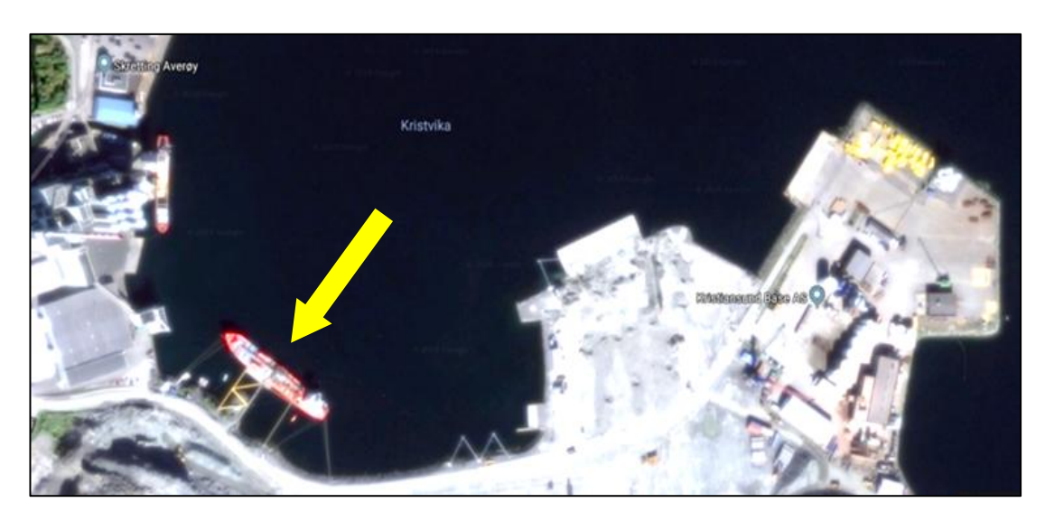
Figure 5: Crude Passion moored at Averøy

At 0945, on 31 August, Key Fighter arrived at Averøy and moored alongside the chemical / oil tanker Crude Passion <sup>5</sup> (Figure 5). Key Fighter commenced discharge of the remaining Rapeseed oil from cargo tanks nos. 3, 4, 5 and 6 port and starboard. The cargo discharge was completed at 1945.