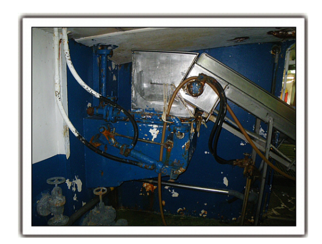
Figure 3. Waste hopper

When the Skipper went up to the wheelhouse, he ordered the entire crew to don their life vests and to prepare the life rafts. The crew donned their life vests and lowered the port side life raft that was located further forward, next to the wheelhouse but due to the movements of the vessel, the raft turned over. Subsequently, the port side life raft that was stowed aft of the raft that had been previously lowered was itself lowered. The rafts had to be tied due to their tendency to separate from the vessel.