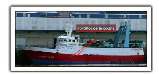
Figure 2. Position of the galley portholes

At that moment an alarm sounded, which was not recognized by the crew and alerted the Second Skipper who was on watch at the wheelhouse. After verifying that the vessel was heeling towards the port side, the Second Skipper carried out the following actions in an attempt to correct the heeling condition: