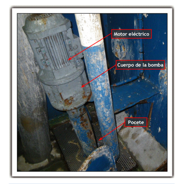
Figure 4. Stern sump pump located on the starboard side of the fishing area

The First Mechanic went up to the upper deck in an attempt to right the vessel by hanging a weight from the hydraulic crane on the starboard side. While they were preparing the manoeuvre, the port generator's motor stopped and the vessel lost all electrical power. The vessel only had emergency lighting until the First mechanic went down to the engine room and started the motor for the starboard generator.