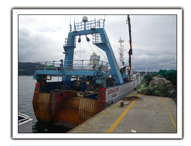
Figure 5. Fishing vessel CURRANA TRES.

Originally, the vessel was called NUEVO HERMANOS ARIAS and her owner was Spanish fishing company Pesqueras Arial S.L., but in April 2005, the vessel was bought by the current owner, who changed her name.