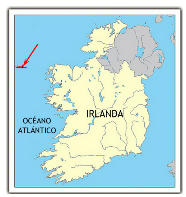
Figure 1. Location of the incident

The following report of the events has been drafted from statements provided by the crew and other documents. The times referred to in the report have been taken from the ship's clock.